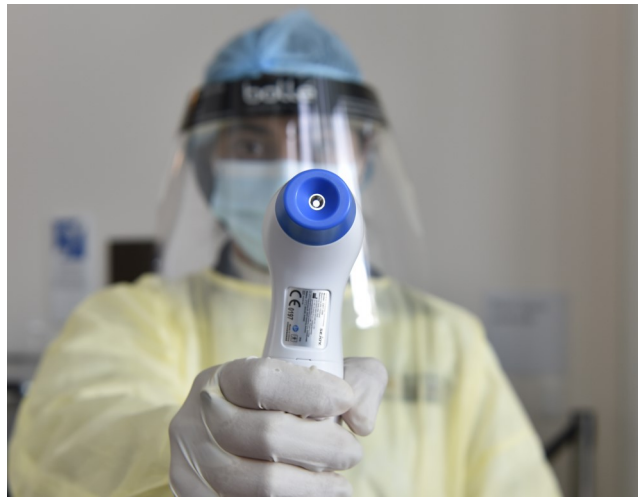
Paul Furness Auspic/DPS

18 National Circuit, Barton, Canberra, Australian Capital Territory